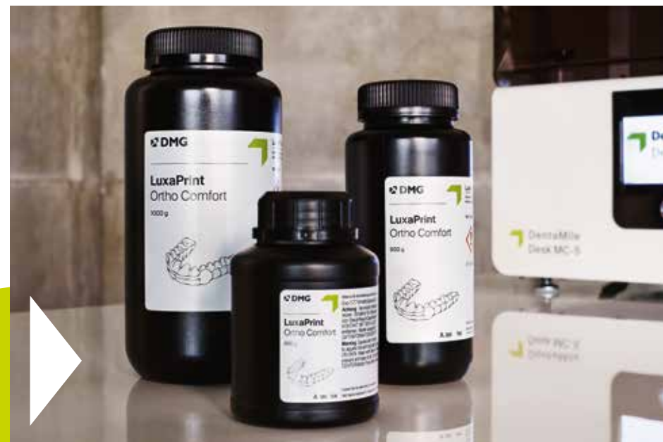
Material: LuxaPrint Ortho Comfort