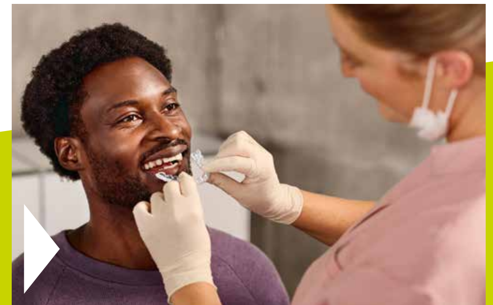
Perfect, precise results and satisfied patients

Design a perfectly fitting splint that offers the highest functionality and wearing comfort effortlessly and efficiently from a high-quality material with extreme stability and flexibility in just one session.